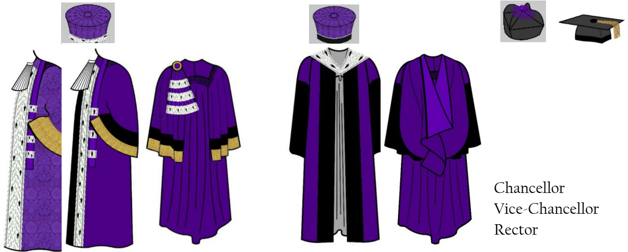
Chancellor Vice-Chancellor Rector